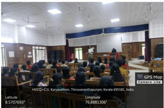
Photographs of Orientation Session of YIP 5.0 (2022-23) and list of participants and resource persons