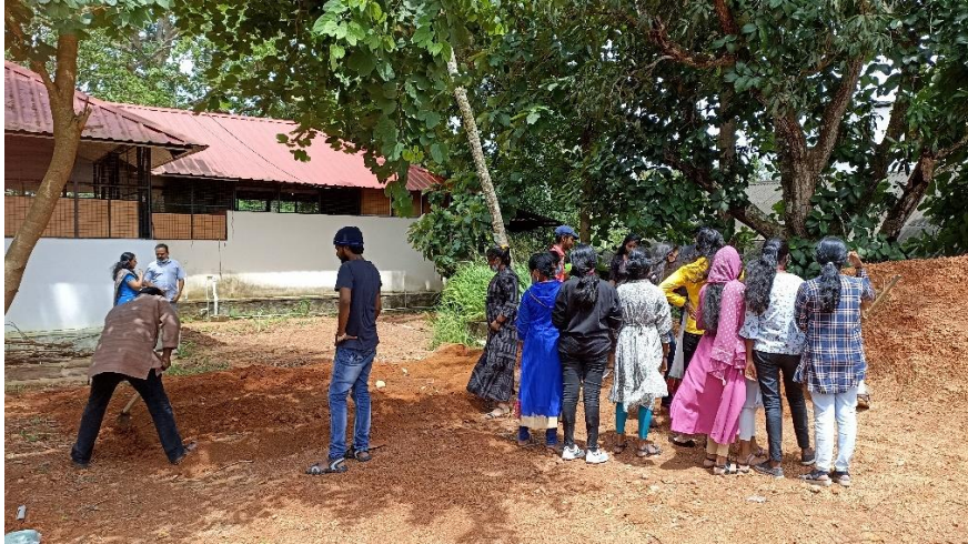
Activities of Karshakasangham 2022