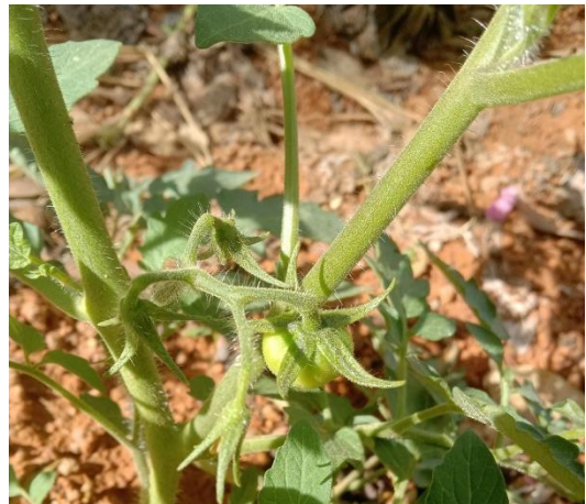
Activities of Karshakasangham 2022