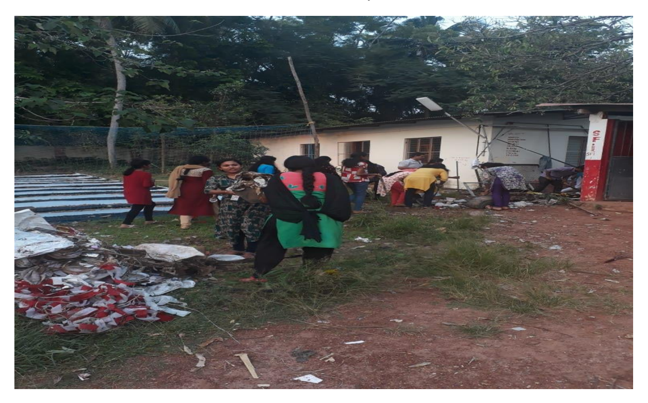
Session 3: Community Service