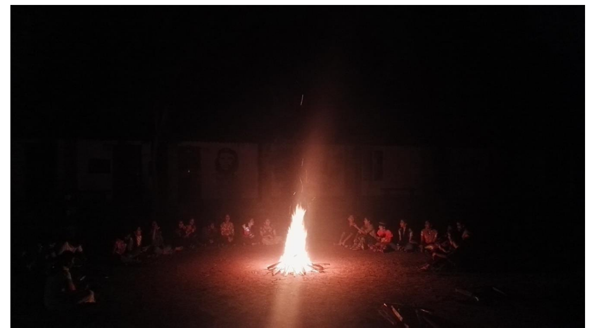
Session 4: Camp fire

After dinner, the students came together to give a review about their first day over the camp fire. All the students stated that their first day was enriching. The first day concluded with a few cultural programmes organized by the students.