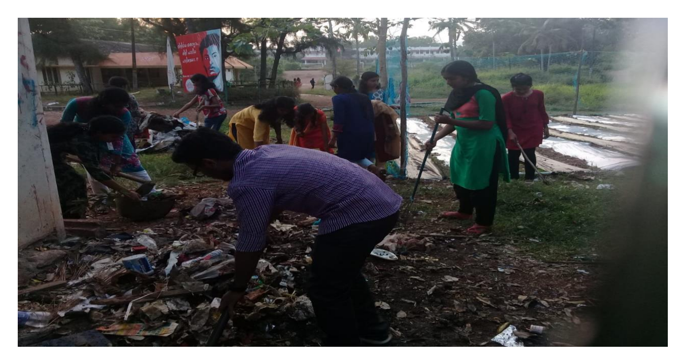
Session 2: Community Service

After evening break, the students were eagerly waiting for the Community Service Session.