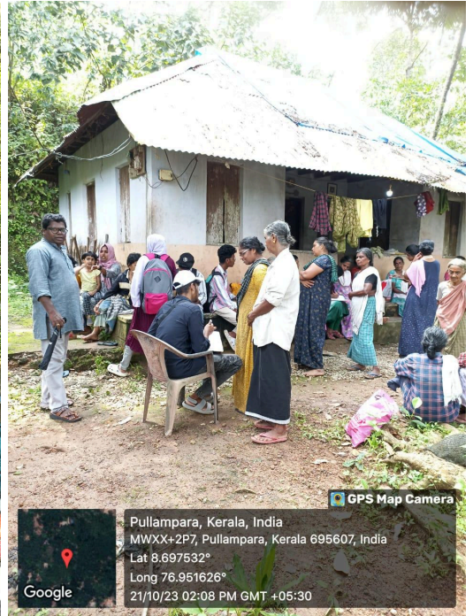
GPS Map Camera Pullampara, Kerala, India MWXX+2P7, Pullampara, Kerala 695607, India Lat 8.697532° Long 76.951626° Google 21/10/23 02:08 PM GMT +05:30