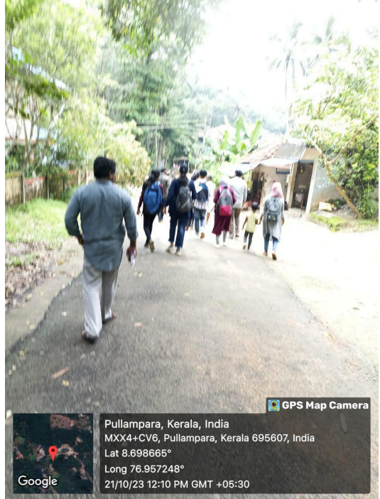
GPS Map Camera Pullampara, Kerala, India MX4+CV6, Pullampara, Kerala 695607, India Lat 8.698665° Long 76.957248° Google 21/10/23 12:10 PM GMT +05:30