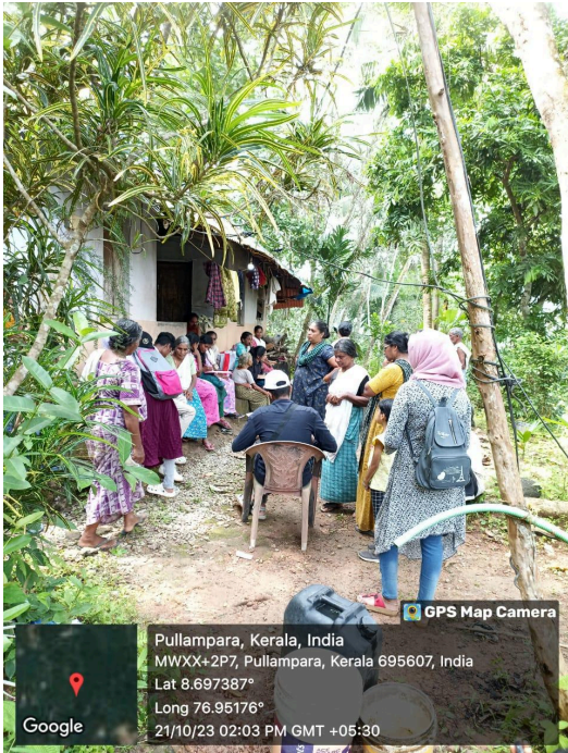
GPS Map Camera Pullampara, Kerala, India MWXX+2P7, Pullampara, Kerala 695607, India Lat 8.697387° Long 76.95176° Google 21/10/23 02:03 PM GMT +05:30