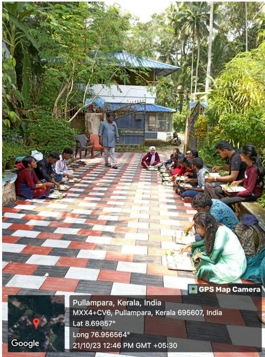
GPS Map Camera Pullampara, Kerala, India MX4+CV6, Pullampara, Kerala 695607, India Lat 8.69857° Long 76.956564° Google 21/10/23 12:46 PM GMT +05:30