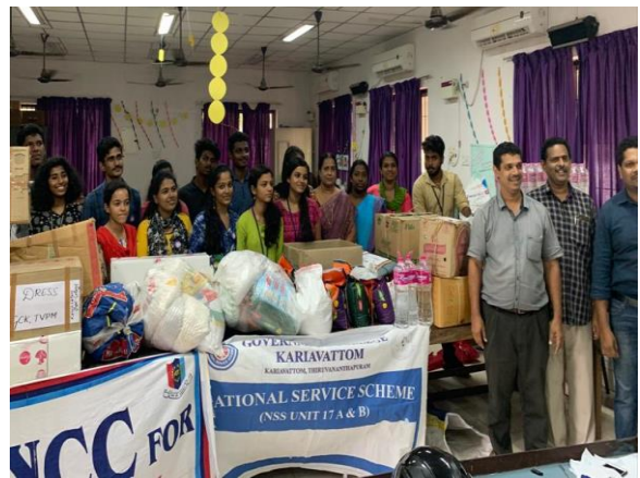
Fig: Flood Relief material collection of Govt College Kariavattom