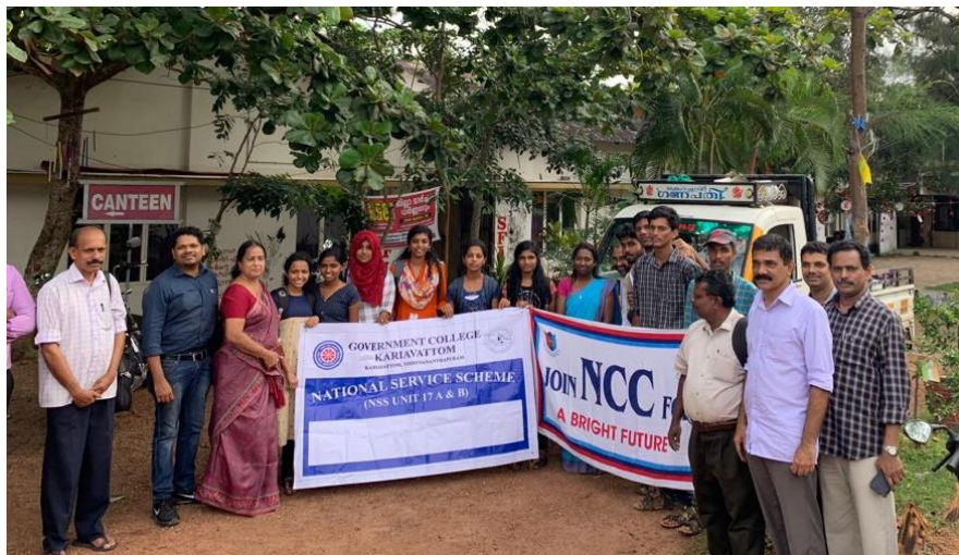
Fig: Flood Relief material collection of Govt College Kariavattom