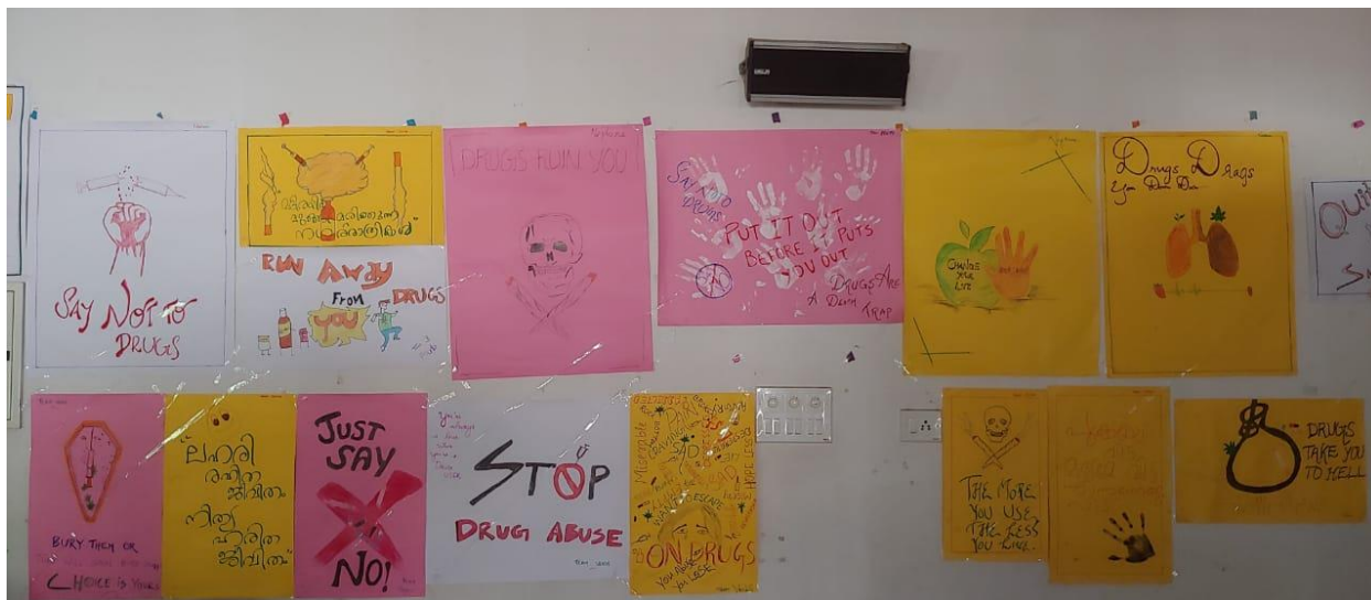
Fig- Posters prepared by the Volunteers in relation with Anti-Drug Awareness Campaign