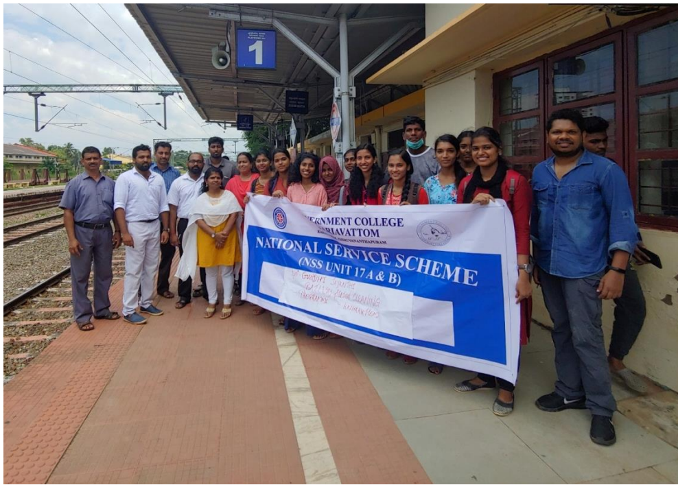
Fig: Cleaning of railway platform and removal of plastics and other wastes from the railway tracks of Kazhakoottam Railway Station on 02/10/2019

As a part of 150 th birth Anniversary celebration of Gandhiji and Gandhi Jayanthi Celebration 2019 , NSS Unit 17 A and B were directed to do activities in Kazhakoottam Railway Station. Kazhakoottam Railway Station is an important railway station where lot of passengers especially students and workers of nearerby palces of Kazhakoottam region depends which includes Technopark IT companies, various Colleges, Public and Private Offices etc. A total of 30 volunteers were selected to do activities in the railway station under the supervision of Volunteer captains Smt. Nighitha TN and Sri. Sabarinath and program Officers, Dr. Raghul Subin S and Smt. Sunitha S. Major activities carried out were cleaning the premises of Railway Station and the railway tracks in front of Kazhakoottam Railway Station. The Station Master and supporting staffs also actively support the volunteers to finish their mission.