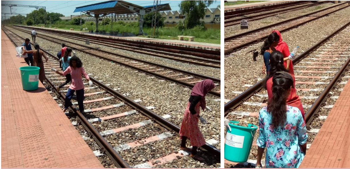
Fig: Removal of plastics and other wastes from railway tracks in front of Kazhakoottam Railway Station, Thiruvananthapuram