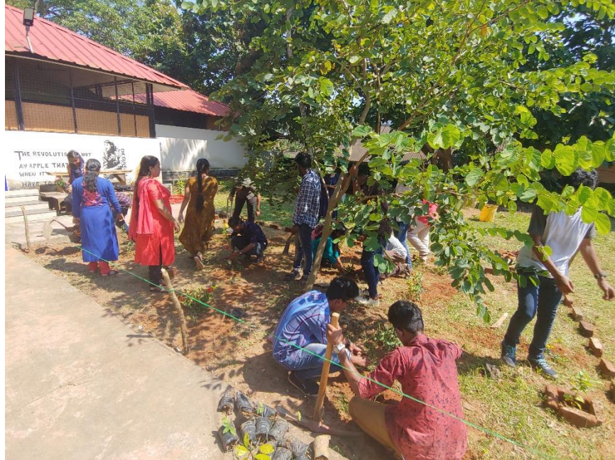
Fig: Setting up of butterfly park in front of college canteen