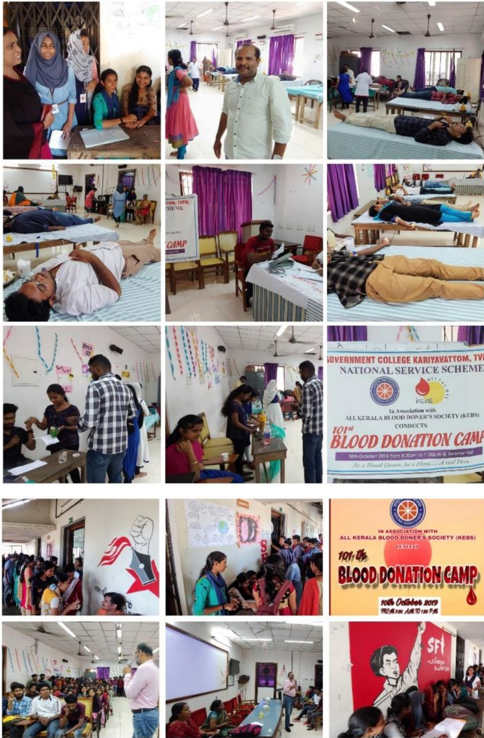
Blood Donation Camp 2019 organized by NSS Unit 17 A & B, Government College Kariavattom