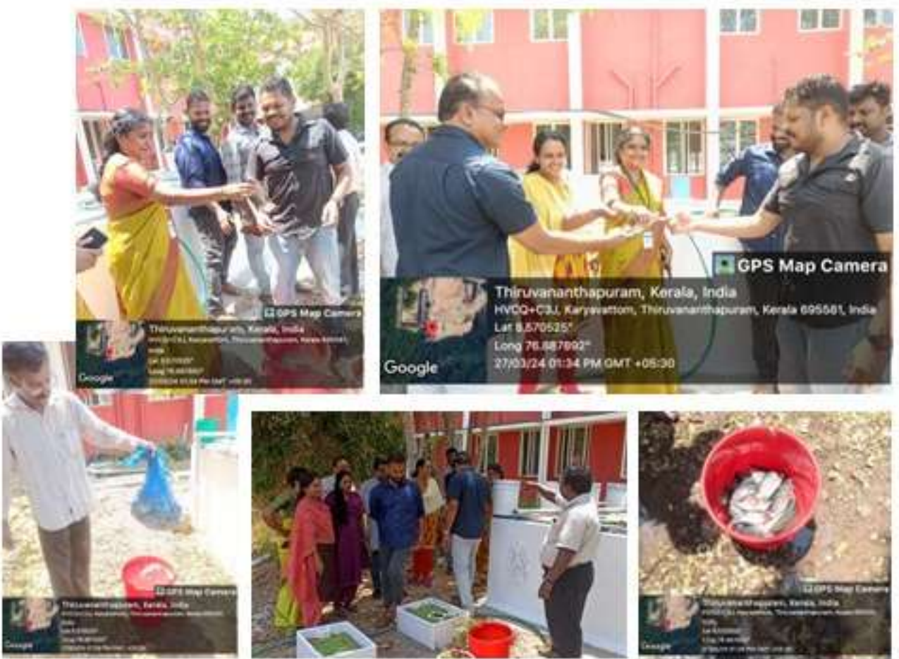
Initial harvesting of fish farming held on 27/03/2024