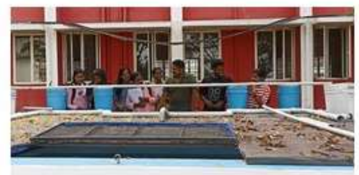
During the updation of aquaculture setup into Integrated fish farming system-Aquaponics. Zoology faculty explains the concept of aquaponics to the students.