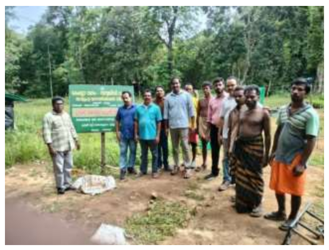
Collecting tree sapling from Kerala Forest and Wildlife Department nursery at Palode

Environmental day celebration was observed in the campus on 5th June 2023. One week program were conducted. The day observation were done with tree sapling planting in the campus area. The activities were jointly initiated by NCC, Government College Kariavattom, NSS Unit 17 A&B, Government College Kariavattom, Environmental Club, GCK. Nature club members were actively participated in this program. A whole week program were conducted for this day observation. Campus cleaning and setting up of vegetable garden were also done during this period. A total of 1000 tree saplings were collected from Kerala Forest and Wildlife Department nursery at Palode for planting in the campus sorroundings. Few tree saplings were distributed among students.