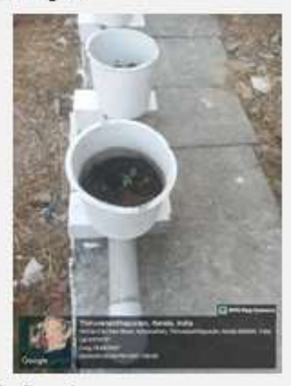
Whip irrigation installed along with fish farming