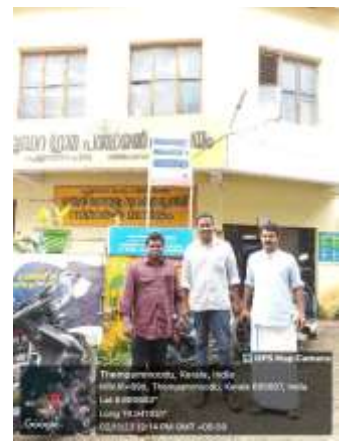
Discussion with Vamanapuram Grama Panchayath President and Panchayath Authorities

Several activities were planned to carryout in the adopted village by including the involvement of all the departments and clubs in the government college Kariavattom. On 21st October 2023, NSS volunteers and graduate students of BSc Geography and BSc Statistics conducted a socio-economic survey in the adopted village accompanied by faculties of our institution.