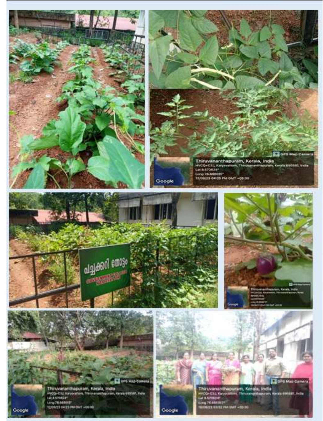
Organic Farming - Vegetable Garden in the campus