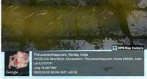
Freshwater fish farming in college campus