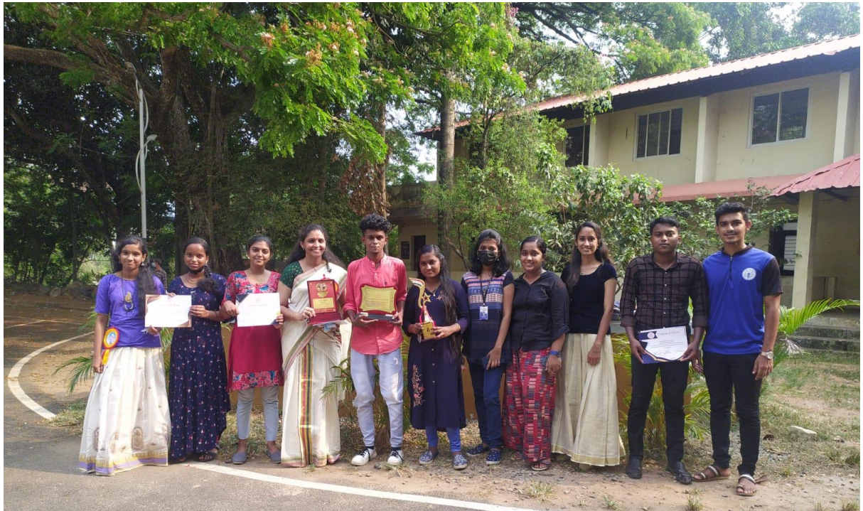
Award for best Student Palliative care activity (for Program Officer, volunteer, and College)