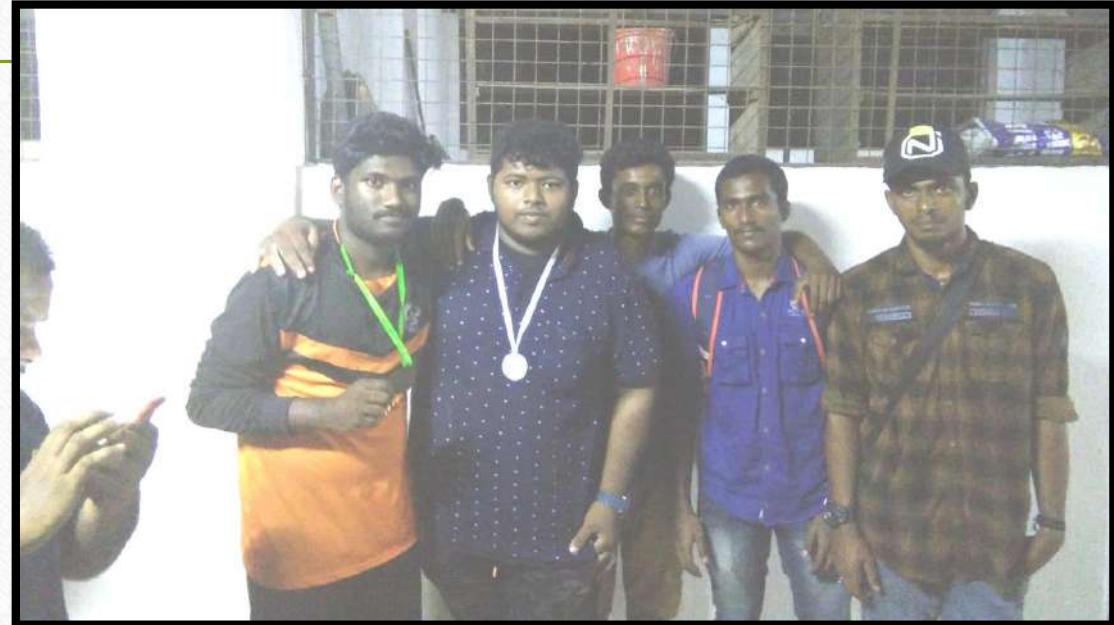
COLLEGE WEIGHT LIFTING TEAM( won two medals in Kerala University Weight lifting championship 2018-19)