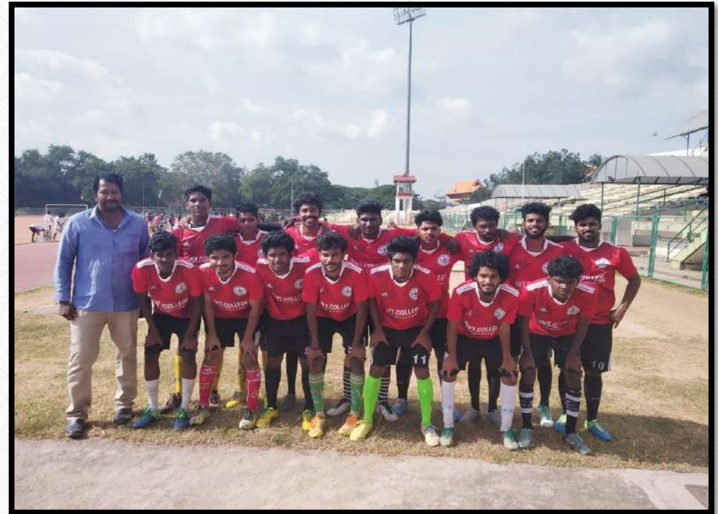
COLLEGE FOOT BALL TEAM 2018-19