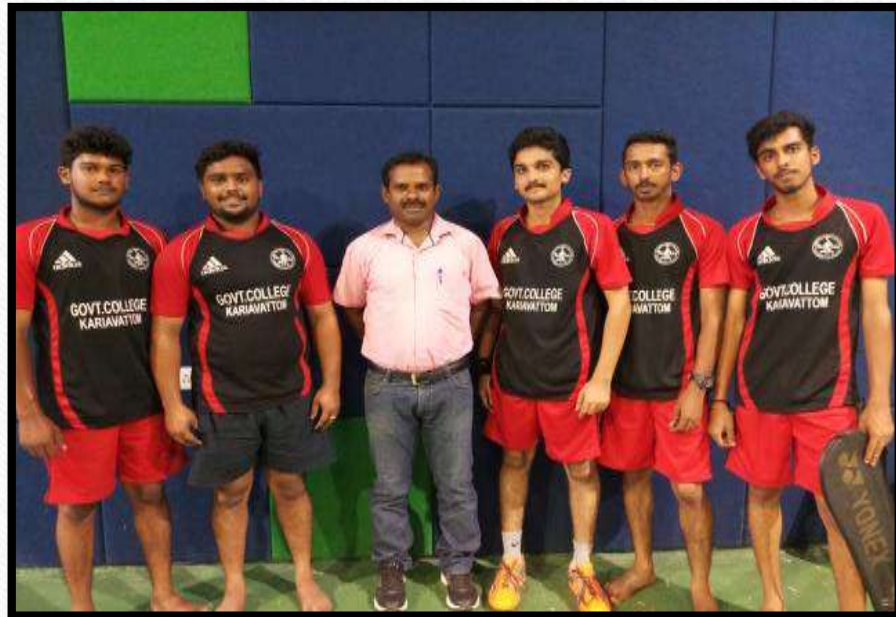
Shuttle Badminton (MEN) team has participated in the Kerala University Inter Collegiate Shuttle badminton Championship held at Toss Academy, Manacaud.