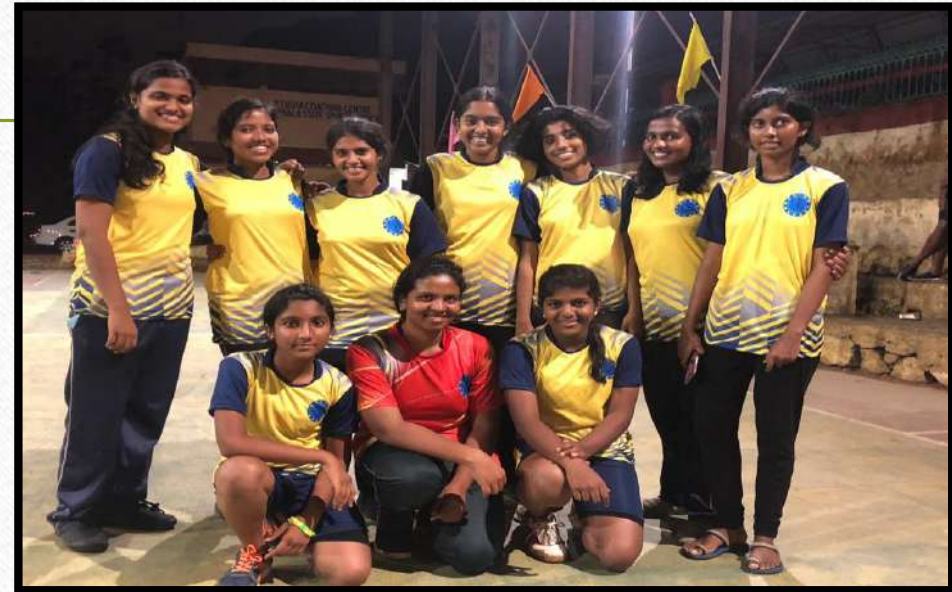
STATE MEDALIST IN ROLL BALL CHAMPIONSHIP (2018-19) won 2 silver 5 bronze)