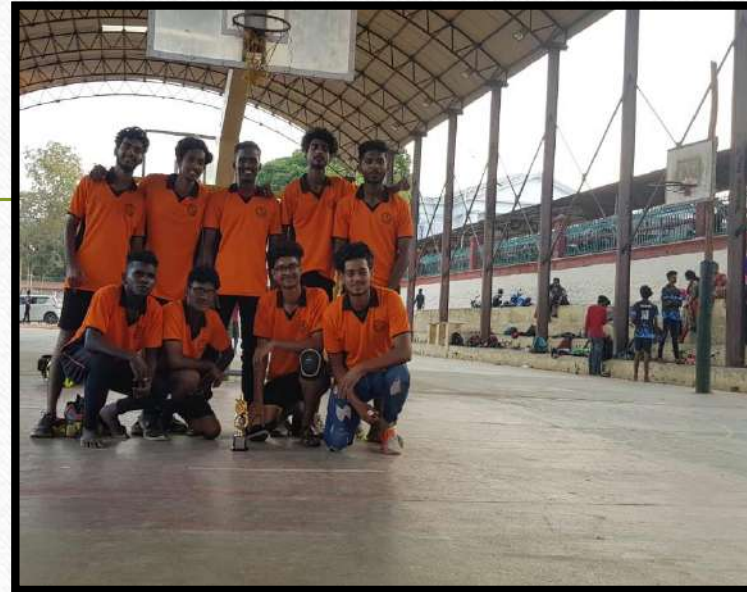
COLLEGE ROLL BALL TEAM (MEN) WON FOURTH POSITION IN KERALA UNIVERSITY INTERCOLLEGIATE ROLL BALL CHAMPIONSHIP