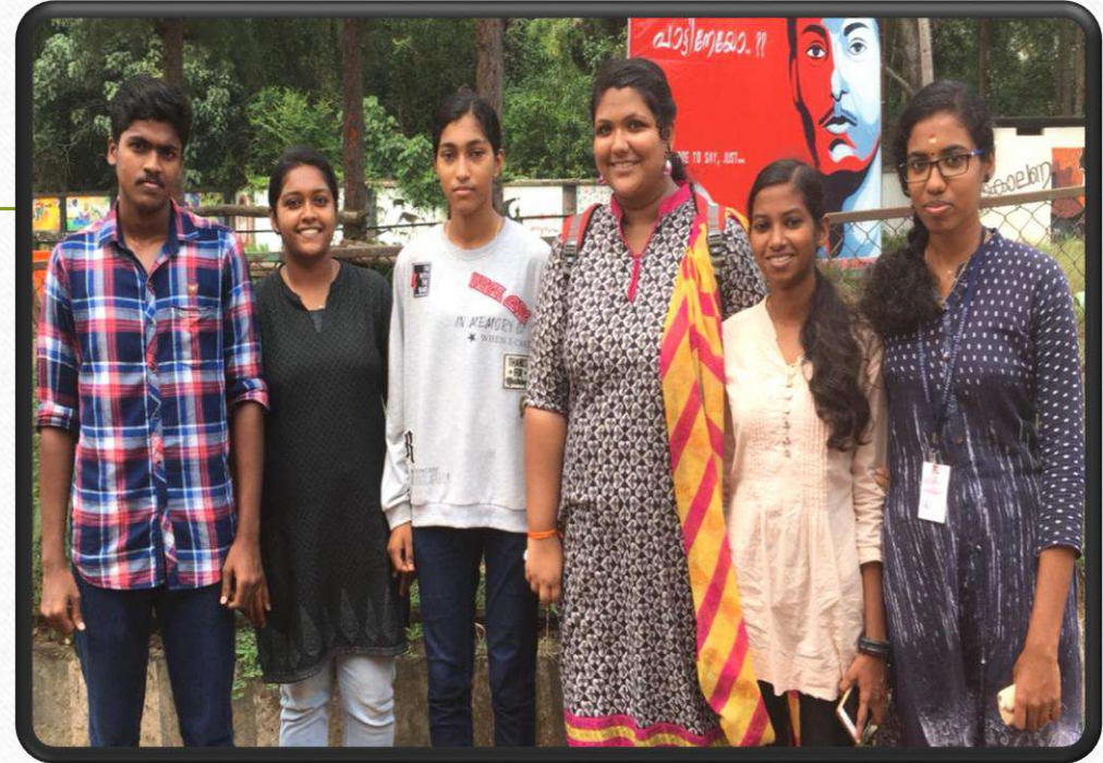
ARCHERY WOMEN TEAM (OVERALL THIRD IN KERALA UNIVERSITY ARCHERY CHAMPIONSHIP 2018-19)