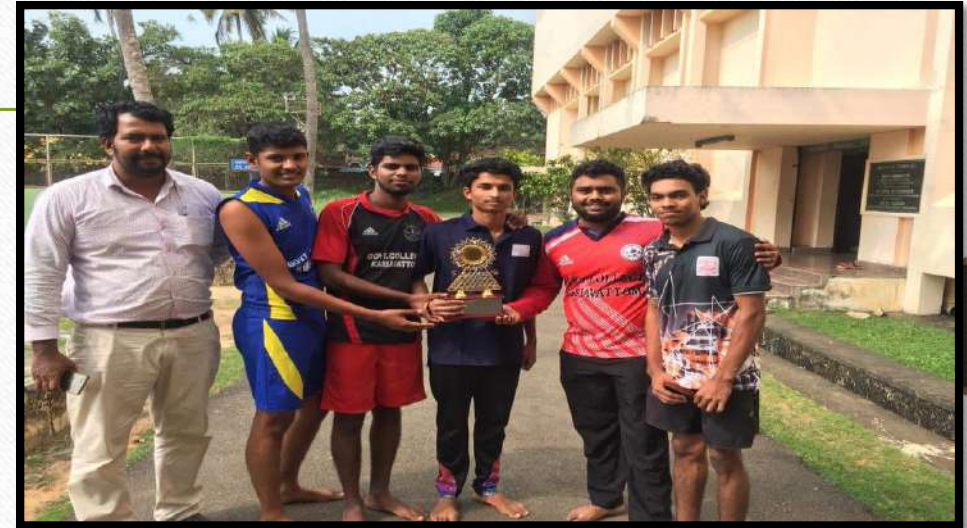
GYMNASTIC MEN TEAM (RUNNER UP IN KERALA UNIVERSITY GYMNASTIC CHAMPIONSHIP 2018-19)( WON FOUR INDIVIDUAL MEDALS)