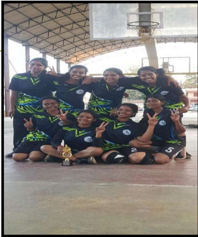
ROLL BALL RUNNER UP IN KERALA UNIVERSITY INTERCOLLEGIATE WOMENS SECTION 2019-20