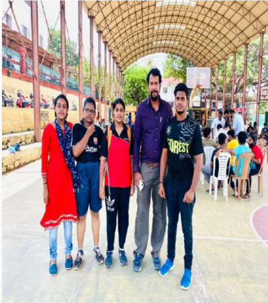
COLLEGE WEIGHT LIFTING TEAM 2019-20