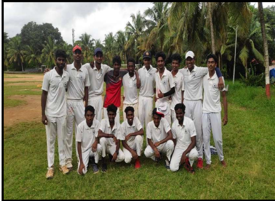
COLLEGE FOOT CRICKET TEAM 2019-20