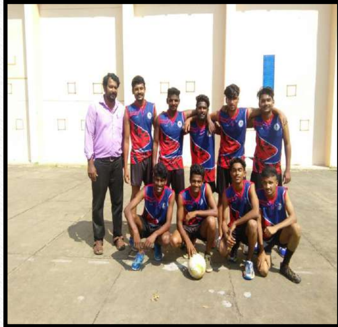
COLLEGE VOLLEY BALL TEAM 2019-20