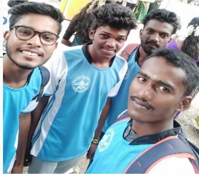
COLLEGE KABADDI TEAM MEMBERS PARTICIPATED FOR UNIVERSITY SELECTION TRIALS 2019-20