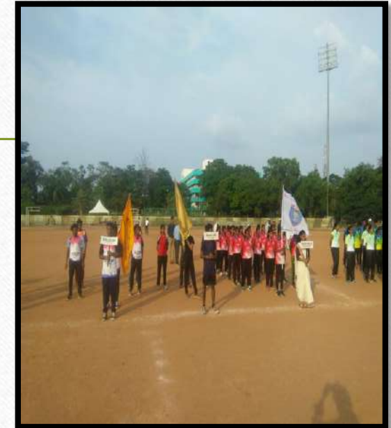
COLLEGE ATHLETICS TEAM PARTICIPATED IN KERALA UNIVERSITY ATHLETIC MEET 2019-20