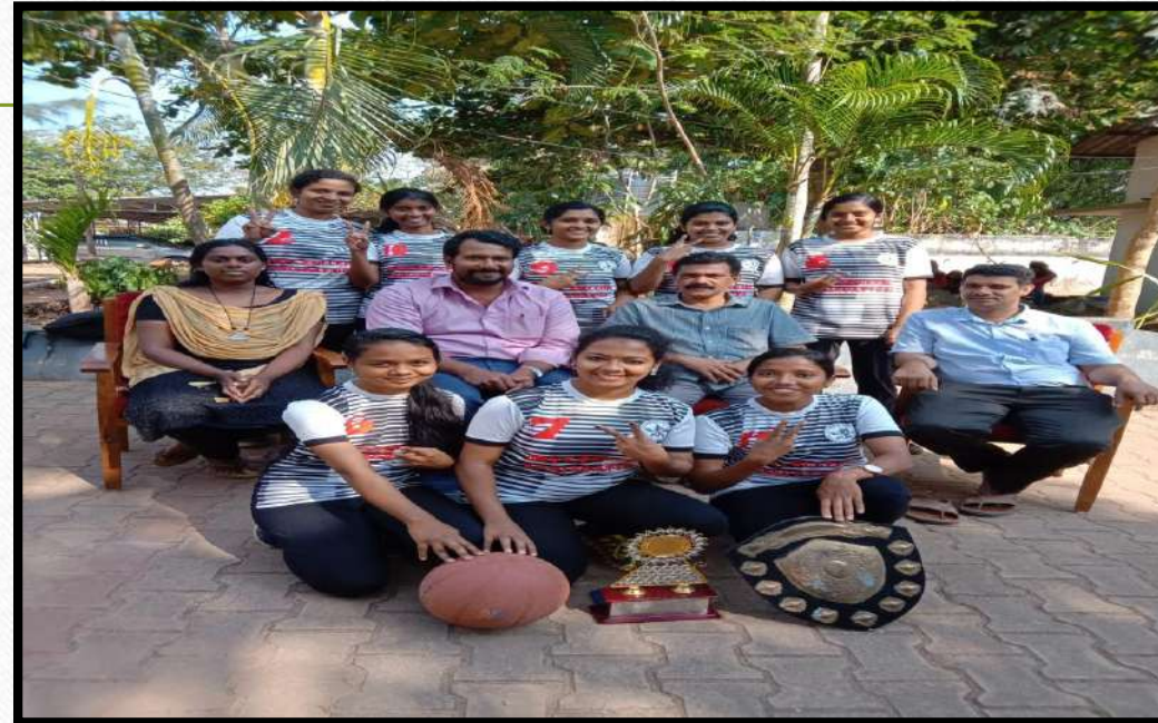
ROLL BALL WINNER IN KERALA UNIVERSITY INTERCOLLEGIATE WOMENS SECTION 2018-19