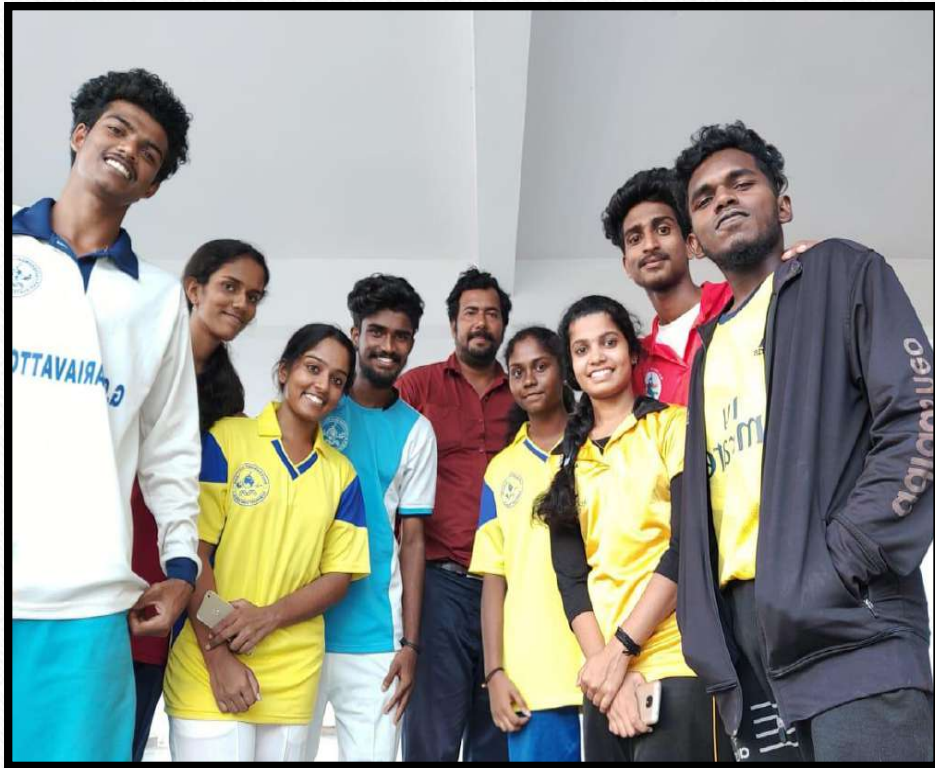
COLLEGE FENCING TEAM