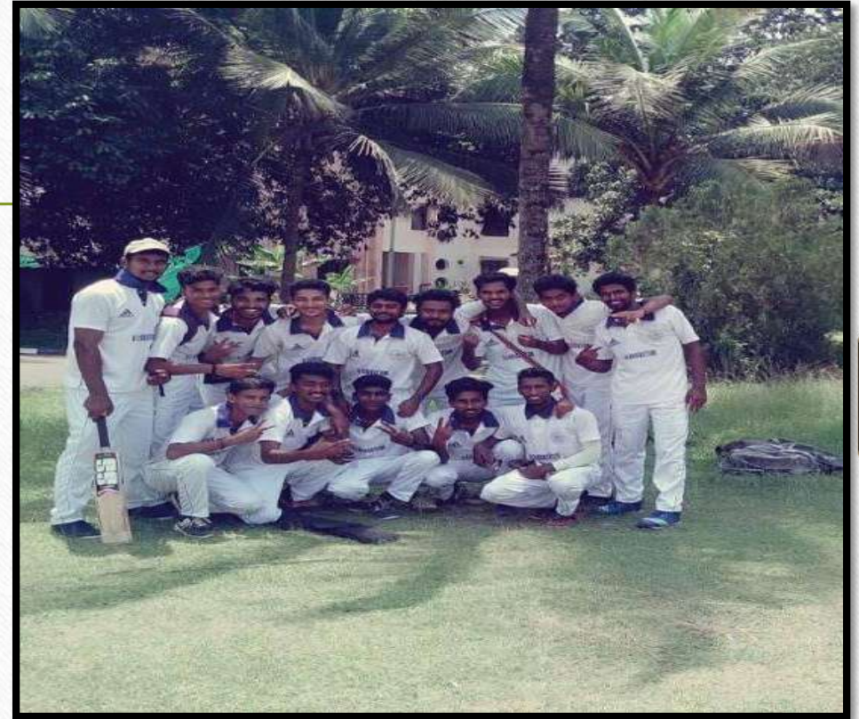
COLLEGE CRICKET TEAM 2018-19