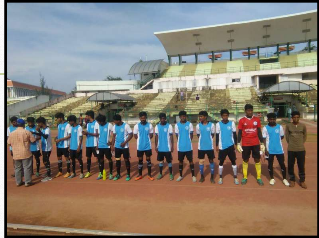
COLLEGE FOOT BALL TEAM 2019-20