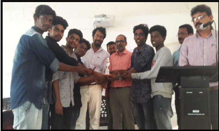
COLLEGE CHESS TEAM (KERALA UNIVERSITY CHESS RUNNERUP IN MENS SECTION 2018-19)