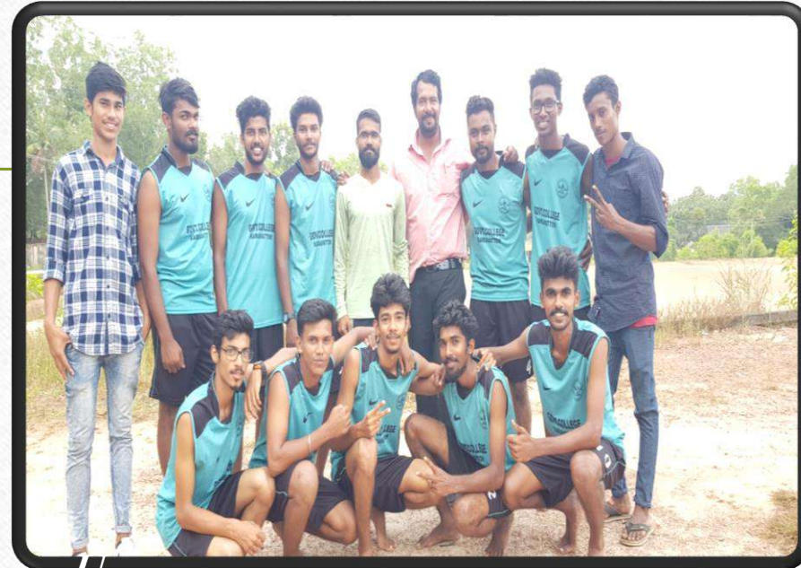
KHO-KHO TEAM WON FOURTH POSITION IN KERALA UNIVERSITY INTERCOLLEGIATE KHO KHO CHAMPIONSHIP (2018-19)

INTERCOLLEGIATE MENCHAMPIONSHIP) TE MENCHAMPIONSHIP)