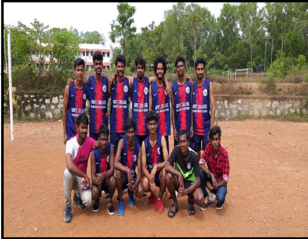
COLLEGE VOLLEY BALL TEAM 2018-19