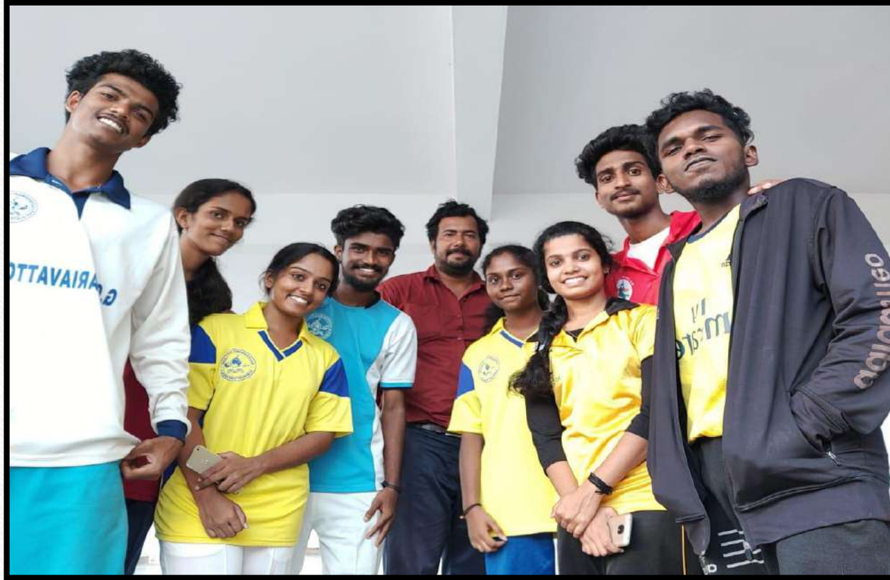
COLLEGE FENCING TEAM 2019-20 WON THIRD IN MEN AND WOMEN CATEGORY (TEAM EVENT)