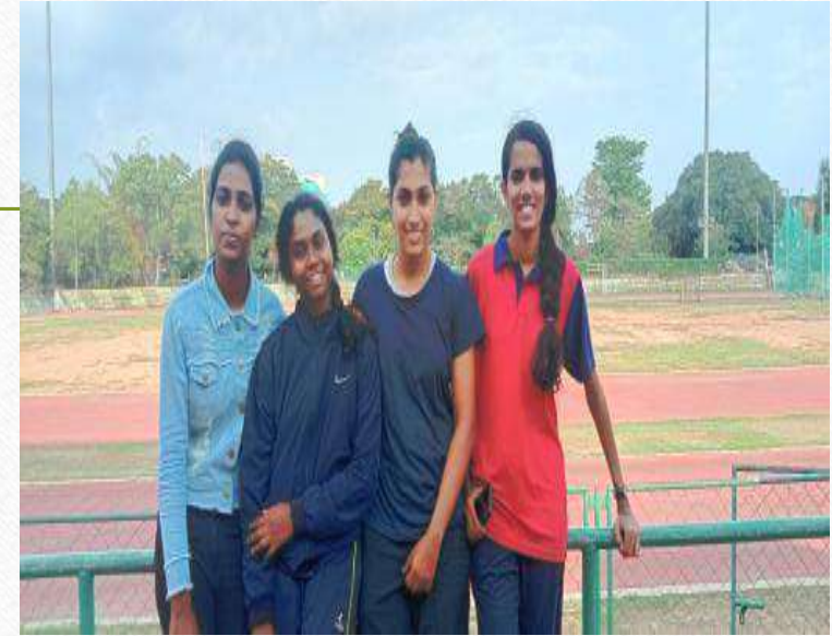
COLLEGE POWERLIFTING TEAM 2019-20