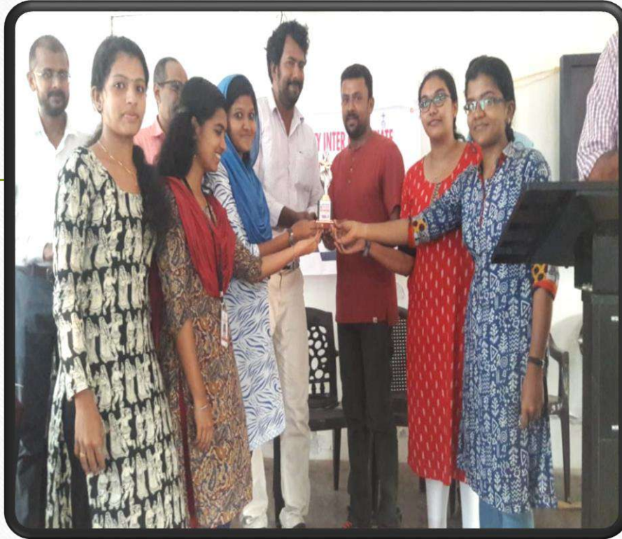
COLLEGE CHESS TEAM (RUNNER UP IN KERALA UNIVERSITY INTERCOLLEGIATE WOMENS CHAMPIONSHIP 2018-19) HELD AT MANNANIYA COLLEGE