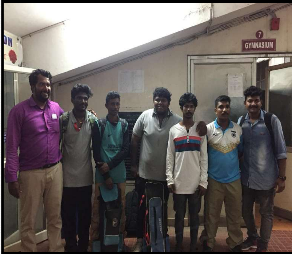
ARCHERY MEN TEAM (OVERALL THIRD POSITION IN KERALA UNIVERSITY ARCHERY CHAMPIONSHIP 2018-19)