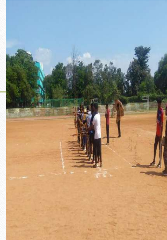
COLLEGE ARCHRY TEAM PARTICIPATING INTERCOLLEGIATE ARCHRY CHAMIPNSHIP 2019-20, HELD AT UNIVERSITY STADIUM