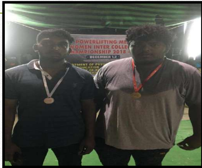
COLLEGE POWER LIFTING TEAM( won two individual medals in Kerala University powerlifting championship 2018-19