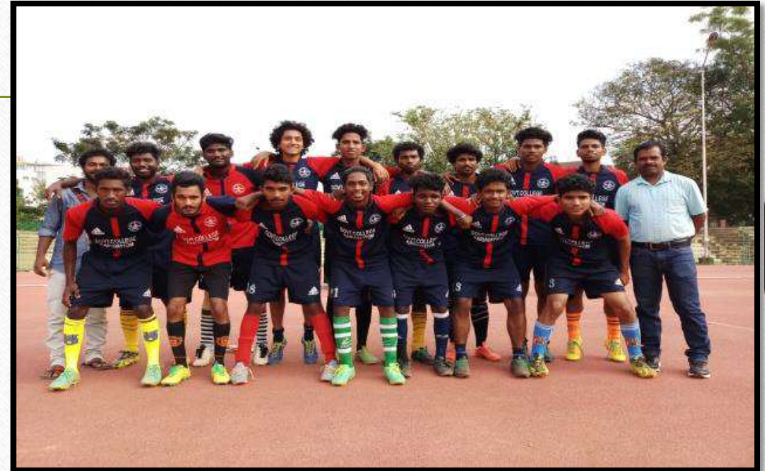
Football team has participated in the Kerala University Inter Collegiate Football tournament held at University Stadium. The team has won four matches and entered in to the Quarter Final.