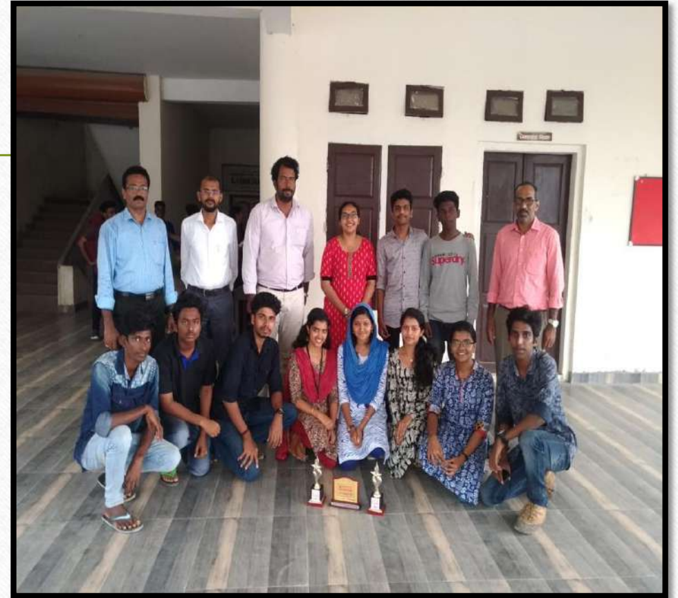
CHESS TEAM OVERALL RUNNER UP IN KERALA UNIVERSITY INTERCOLLEGIATE CHAMPIONSHIP 2018-19