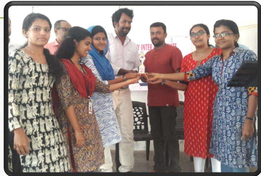
COLLEGE CHESS TEAM RUNNER UP IN KERALA UNIVERSITY INTERCOLLEGIATE WOMENS CHESS CHAMPIONSHIP 2019-20 HELD AT BISHOP MOORE COLLEGE, MAVELIKKARA