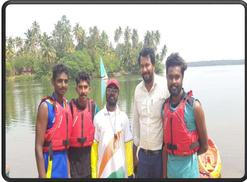
YACHTING MEN TEAM (OVER ALL THIRD POSITION IN KERALA UNIVERSITY INTERCOLLEGIATE YACHTING CHAMPIONSHIP 2018-19)