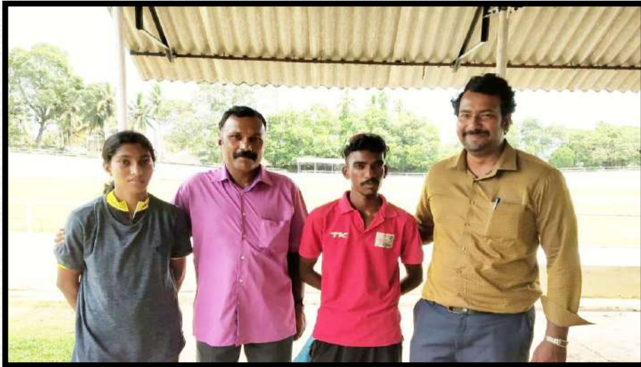
CYCLING TEAM WON 1GOLD WOMENS SECTION & 1GOLD IN MEN SECTION IN KERALA UNIVERSITY CYCLING CHAMPIONSHIP 2018-19