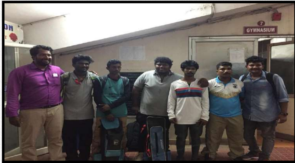
ARCHERY MEN TEAM (OVERALL THIRD POSITION IN KERALA UNIVERSITY ARCHERY CHAMPIONSHIP 2018-19)