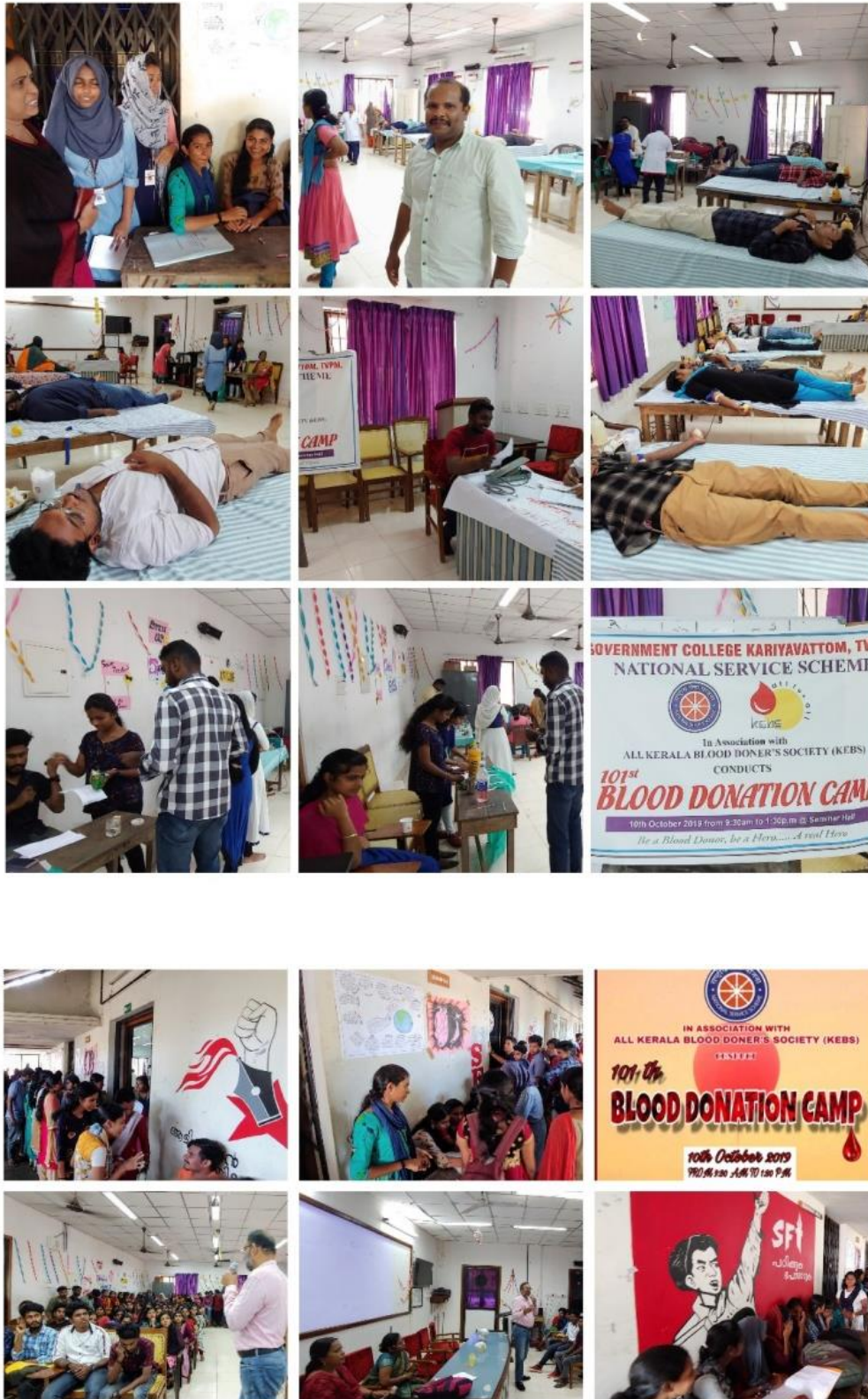
Blood Donation Camp 2019 organized by NSS Unit 17 A & B, Government College Kariavattom