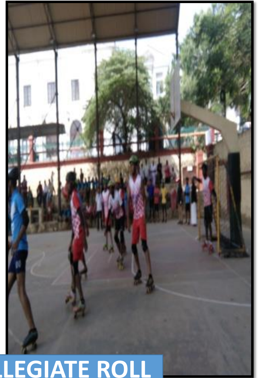
KERALA UNIVERSITY INTERCOLLEGIATE ROLL BALL (MEN & WOMEN)