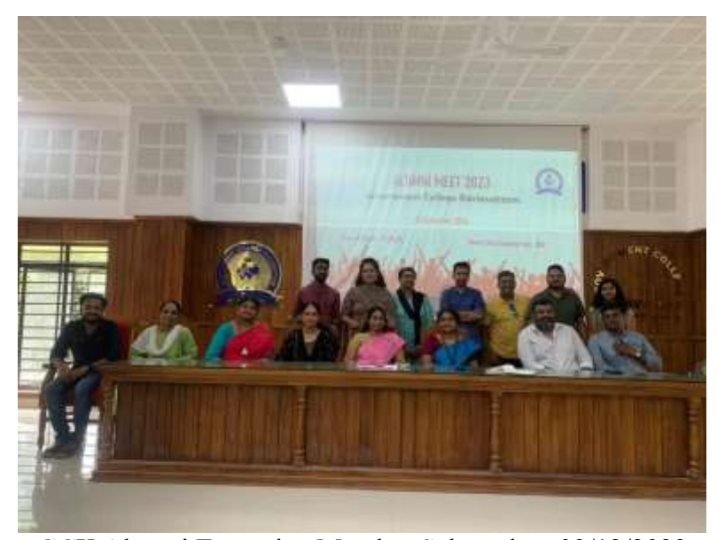
GCK Alumni Executive Member Selected on 09/12/2023

For PG representation to the Alumni, one seat is made vacant. The committee decided to include a Staff Alumni (previous faculties/principals) as Ex-Officio member to the Executive committee which will be decided in the coming committees. It was decided that the next executive committee to held at the earliest with an aim to finalize the byelaws and other initiations related to registration and other activities of the association.