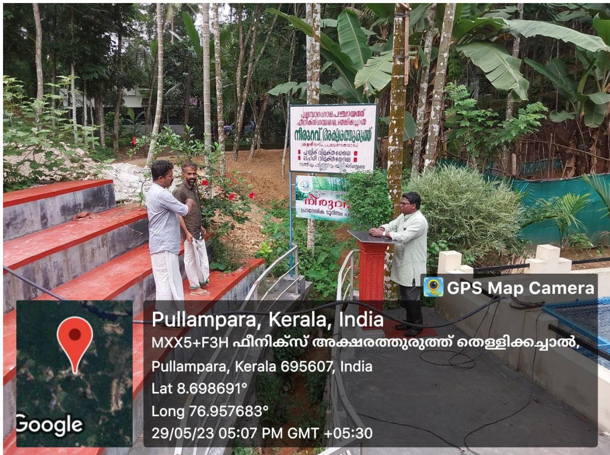
Fig. 2. Ensuring that the space is suitable for organizing and delivering knowledge dissemination sessions beneficial to the villagers

No source is better than books to gain valuable knowledge and enlighten oneself. The cultivation of the habit of reading will undoubtedly increase the social, cultural, political, scientific, and literary awareness of people which will eventually lead to the development, self-reliance, and empowerment of the village and its inhabitants. In light of this insight, it was also decided to make necessary contributions from our side to the enhancement of the functionality and efficiency of the village library (Grandhasala) in disseminating information, knowledge, and wisdom to the local people. Thus, Phoenix Grandhasala which was functioning in the village received a good collection of book resources from diverse disciplines and genres from the Nature Club, Gandhian Studies Centre, and IQAC (see Fig. 3. and 4.).