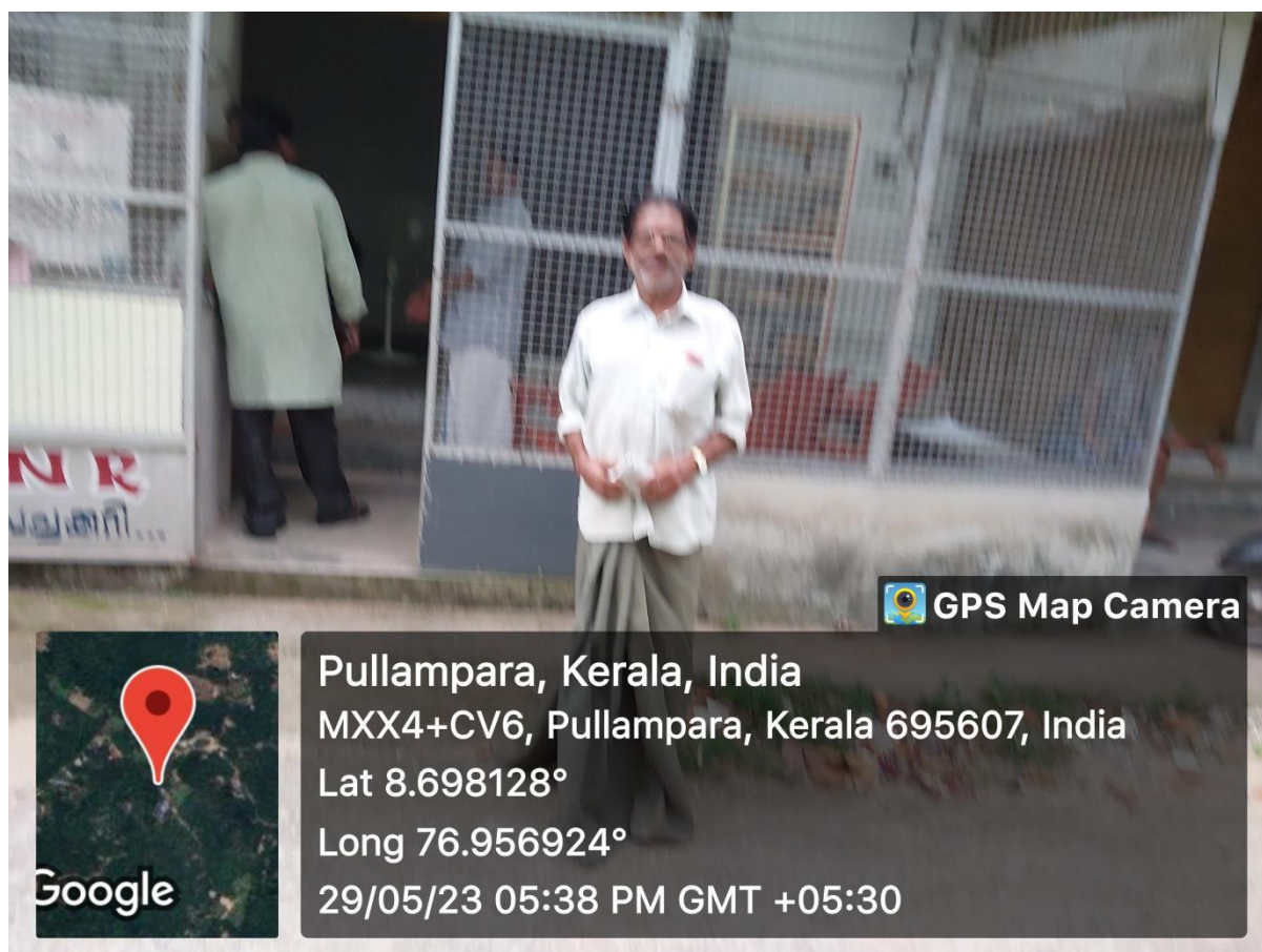
Fig. 5. The members of the Nature Club, Gandhian Studies Centre and IQAC visiting and interacting with the local people

The Nature Club, Gandhian Studies Centre and IQAC found the initiatives to be extremely beneficial to the villagers and the mission received a positive approach from the villagers. The active participation of the villagers in collaboration with the Nature Club, Gandhian Studies Centre and IQAC resulted in the effective functioning of the established facilities. Hence, it was decided by the members to continue the efforts through the implementation of the following measures by the month of October 2023.