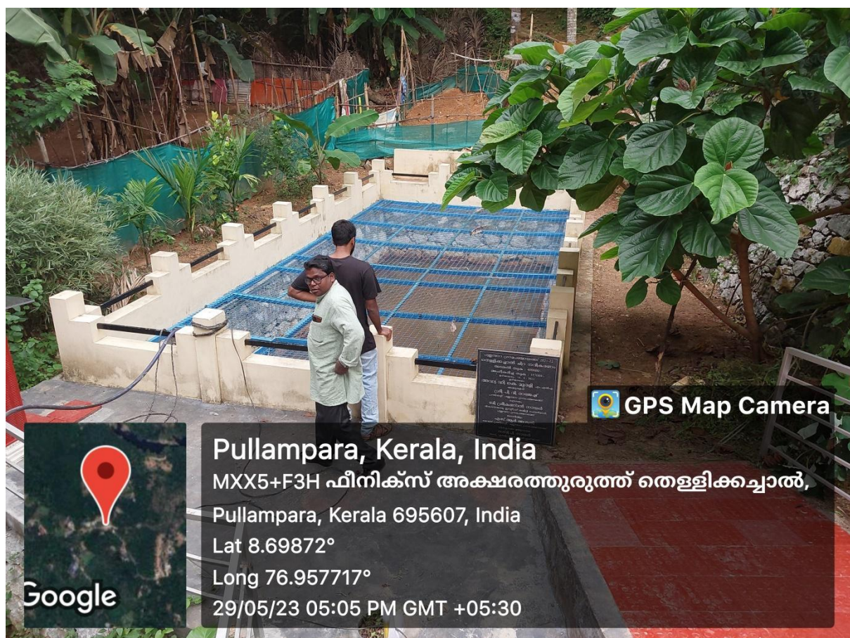
Fig. 1. The public gathering space established for the villagers near the village pond

plan, the initial phase of the mission focused on establishing infrastructure which would result in the enhancement of villagers' accessibility to knowledge systems beneficial for the overall development of the populace. Thus, it was decided to build an exclusive space for the villagers to gather together and share, discuss, and deliberate on issues of contemporary relevance in general and collective development in particular. It was also ensured that this public space could be utilized as a platform for organizing and delivering sessions by eminent personalities and experts from various fields of knowledge to enlighten the villagers on diverse topics. Hence, an appropriate site was located near the village pond and the public assembling space was established without harming the natural scenic beauty and vegetation of the location (see Fig. 1 and 2.).