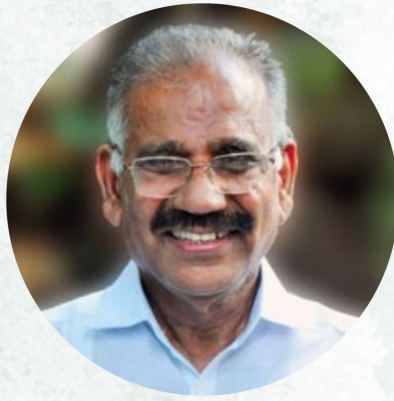
Shri A K Saseendran

Hon. Minister for Forest and Wildlife, Government of Kerala