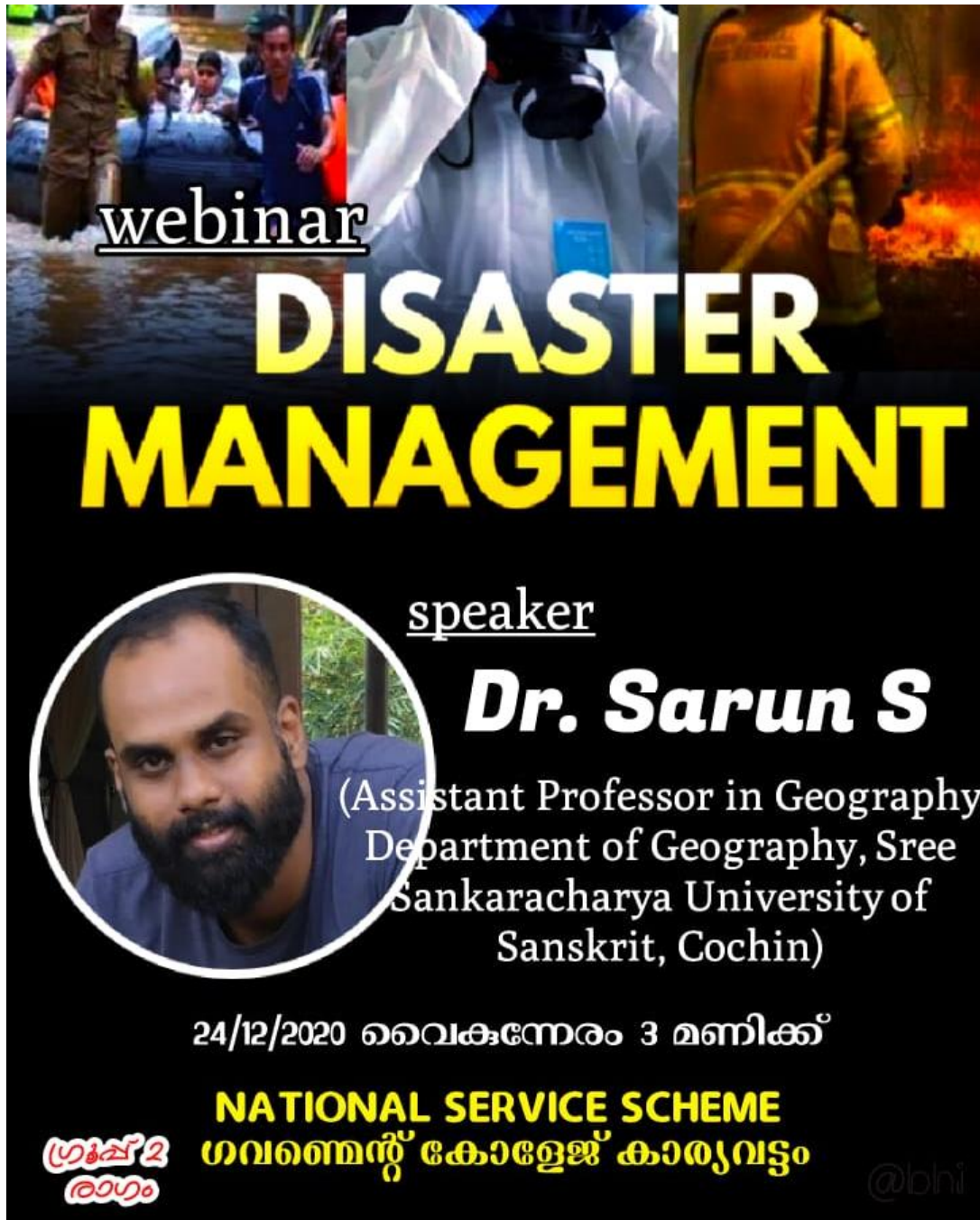
Fig: Invitation for the webinar on DISASTER MANAGEMENT organized by NSS Unit 17 A&B, Government College Kariavattom.